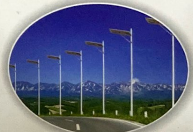
Solar Street Light