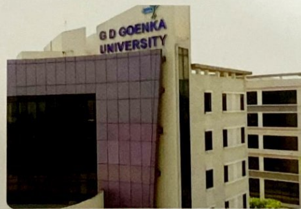
G. D. Goenka University, Sohna, Haryana