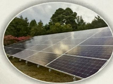
Ground Mounted Solar System