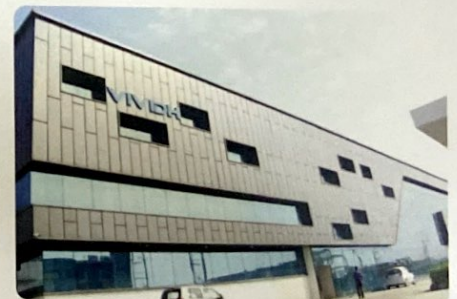
Vividh Wires Pvt. Ltd. Noida