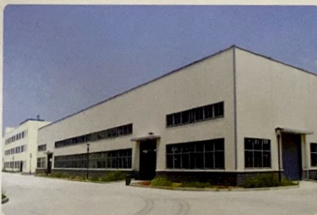
Navya Fashion Pvt. Ltd. Bhilwara