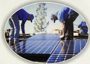
Operation & Maintenance