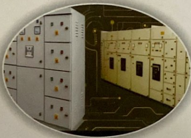
LT Panels & Other Electrical Equipment