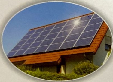
Rooftop Solar System